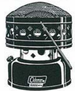
Model 511A700 Discontinued (9-71)